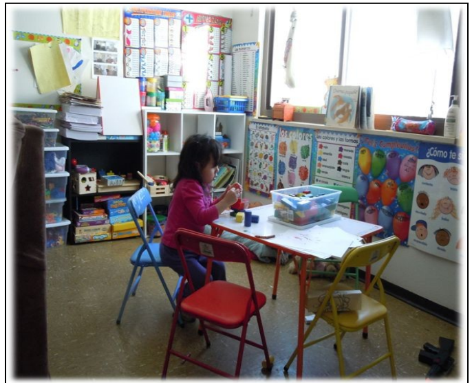
Figure 2: After picture of a caregiver's home

provided with a variety of basic educational materials and instructions for their use: wall posters with numbers and letters; broad low-level shelves to store toys and other materials; tables and chairs with short legs for small children; manipulative materials; games; literacy and numeracy materials; natural science objects; crayons, markers, paints, finger paints, scissors, and other materials for art work; objects for teaching colors; and books in Spanish that were developmentally appropriate for this age group. All materials were provided with a view toward helping the caregiver convert whatever area they had available into a small learning center. When the area available was very small, such as in a trailer or small apartment, the caregiver worked together with the Tías to design the most efficient use of the space available.